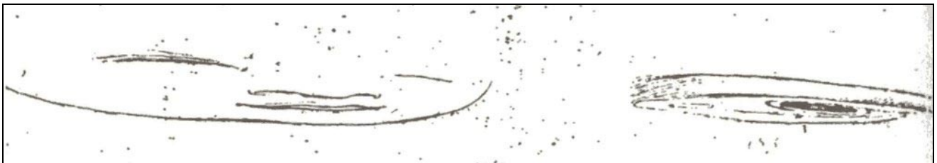
Anamorphoses of a child's head, and an eye, by Leonardo

Against this background, anamorphosis was born. The notebooks of Leonardo da Vinci contain the earliest-known anamorphic drawings, dating from the 1480s: