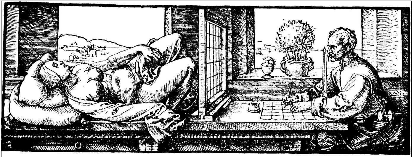
"An artist drawing a nude" by Albrecht Dürer, 1525

Against this background, anamorphosis was born. The notebooks of Leonardo da Vinci contain the earliest-known anamorphic drawings, dating from the 1480s: