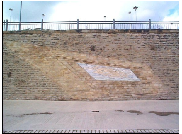
Left: The anamorphosis (on the stone wall) and the observation seat Right: Viewing from a conventional viewpoint